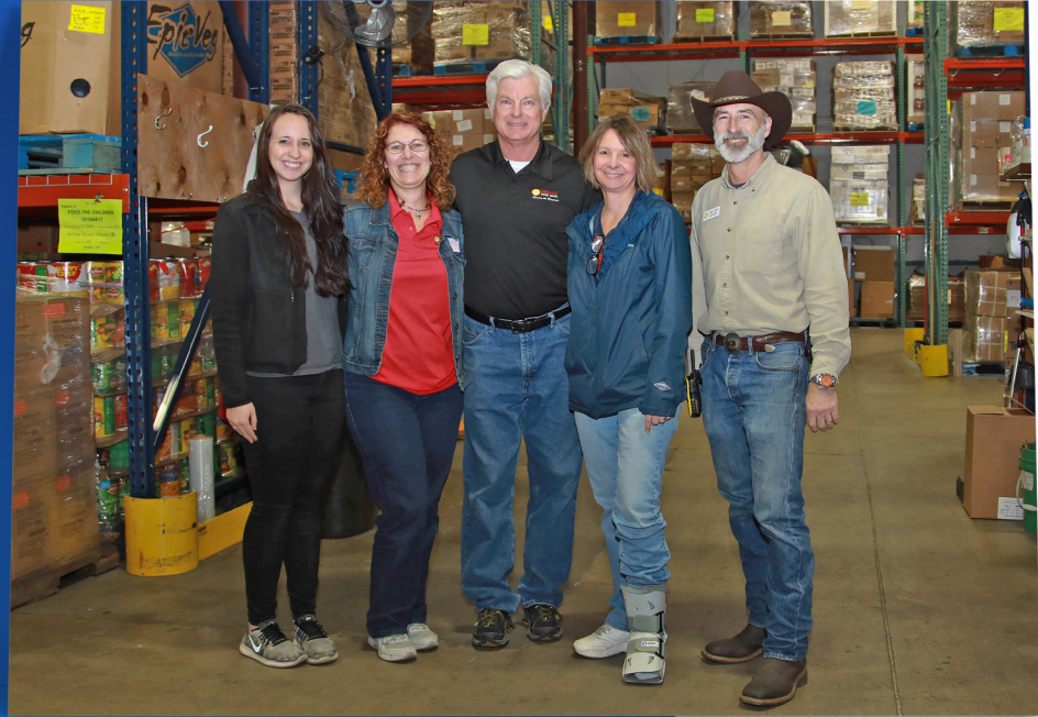
Midwest Food Bank, Georgia Division Staff

According to Charity Navigator, MFB is ranked in the top 8% in the nation, and they have received the Top Award for 6 consecutive years.