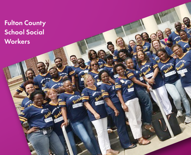
Fulton County School Social Workers